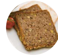
Spread on toast