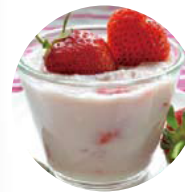
Pour on yogurt

The effect is enhanced when the jelly mixes with saliva.