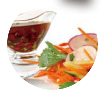
Add to dressing